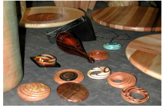
Challenge of the Month winner, Less Black